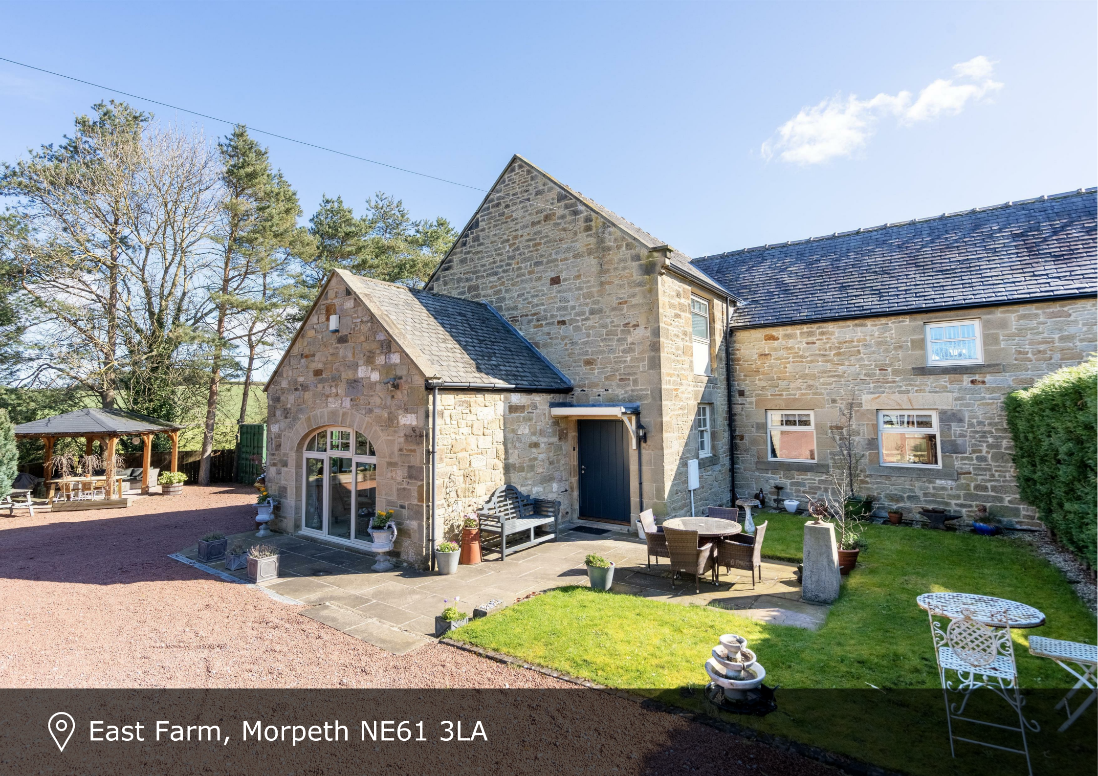
📍 East Farm, Morpeth NE61 3LA